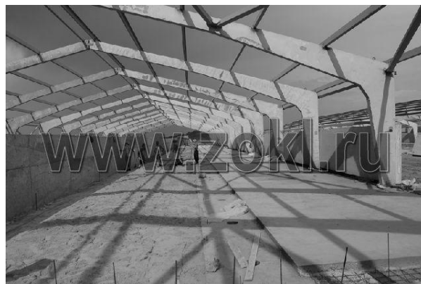
Figure. 1. Internal view of framework building