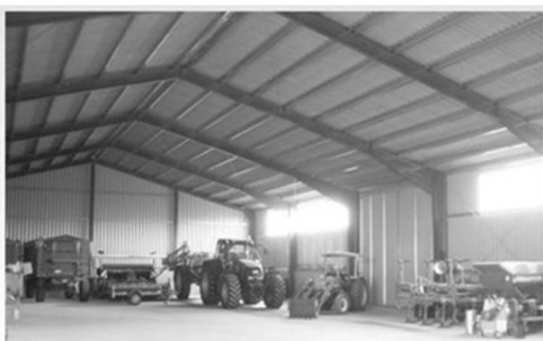
Figure. 3. Metallic frameworks of module buildings

Modern development of business stipulated a change in technology of building and, as a result, replacement of many build materials in accordance with new decisions. Brick and concrete replaced the light metal which application has been made possible thanks to the new engineering solutions. The result of these changes was the widespread introduction of technology the construction of buildings, which are based on modular steel structures (figure. 3). Today, these technologies are priority.