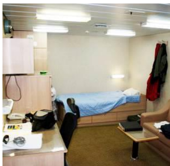
“LARISSA”.Company R/V Araon. South Korea 2010.[10]

Interiors for cargo ships made with reference to save space (Fig.3).