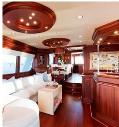
“VICEM 96 CRUISER” VicemYachts. Turkey 2014.[8]