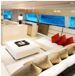
“RedDragon”. WilmotteAssociates. New Zeland 2008.[7]

Image analysis showed that in yacht interiors are tending to choose such colors: brown – 23%, beige – 28%, white – 43% and gray 15% (Fig.2).