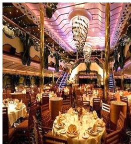
“Carnival Splendor”. Carnival Cruise Lines Company. Italy. 2008.[6]

Image analysis showed that cruise ships are characterized by three color palettes, which are often used: beige-brown – 64%, burgundy-red – 22% and “sea wave” colors – 14% (Fig.1).