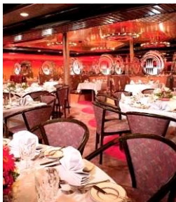
“Carnival Ecstasy”. Carnival Cruise Lines Company. Finland. 1991.[6]