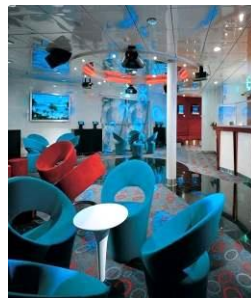
“Carnival Glory”. Carnival Cruise Lines Company. Italy. 2006.[6]