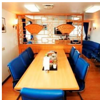
“HHL VALPARAISO”. Hansa Heavy Lift. Monrovia 2010.[11]