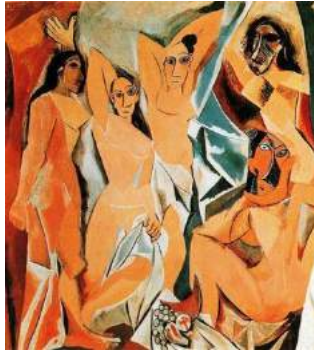
Image 1. Picasso, Les Demoiselles d'Avignon

affirmation of the state of deformation as a norm, and the leading slogan in the twentieth century was the following slogan: the less art is reflected in real life, the more it is art. In a particular way, this led to a literal hacking of the public consciousness, against the backdrop of an intense flurry of scientific discoveries, which led to the paradoxical definition by human anthropologists of the late 19th - early 20th century as a transformed animal in culture clothing [2, 48]. Therefore, it is symptomatic that one of the first artistic trends in the aesthetics of the twentieth century considers fauvism (from the French Les Fauves - wild), and its representatives "savages." Fauvism was marked by the emotionality of the world's display, the spontaneity of rhythm and the intensity of color. The mentioned issues increased the interest of artists of the early 20th century with ancient cultural monuments that were kept in large ethnographic collections; in particular, one of the first to draw attention to Picasso, and traditional African forms is manifested in his work: