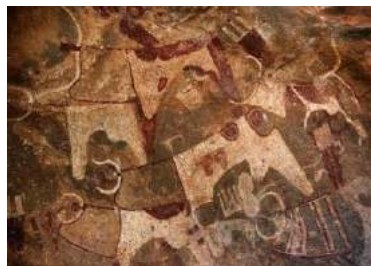
Image 2. Paleolithic Age, Africa

Since the beginning of the twentieth century, the influence of African art l'art nègre has become a fait accompli of European culture and it is also evident in the early avant-garde. In the future, interest is transferred to Oceania, and the Surrealists first borrowed the stylization of natural forms, and Cubism brought this method to the complete abstraction from nature [4, 16]. It is interesting that similar is observed on examples of rock art, where also samples of primitive abstract forms and unreal images: