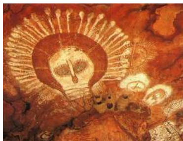
Image 3. Paleolithic Age, Australia

In other words, the convention of form also unites two art traditions, which are extreme in time, in a certain way. However, if the primitive art developed naturally and consistently, the development of the art of the late XIX-early XX century witnessed a tectonic fault, exposed the most sensitive nerves of the human soul and exacerbated the initial emotionality. The mentioned effects have been awoken in it primitive instincts [1, 36]. All these funds were aimed at penetrating into the world of vibrations of the Platonic Shadows or the "stream of consciousness," which brought to the surface numerous interpretations of hidden images. This process can be perceived as juggling with internal neural impulses with the release of the enormous energy of the "split" brain. It is not surprising that many artistic branches have come to replace the