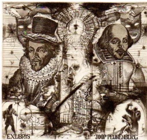
Figure 5 (From personal collection)

In a close stylistic manner, is the creative pattern of S. Ivanov. One of the great artists of Ukraine, S. Ivanov is known as a painter, as well as the creator of easel graphic, book illustration and ex libris . In the field of graphic, his sheets of work are monochrome, using the gradations of tone in a rich palette as a tool of artistic expression (Figure 5: S.Ivanov, Ex libris J. Peijnenburg . Etching, 1994).